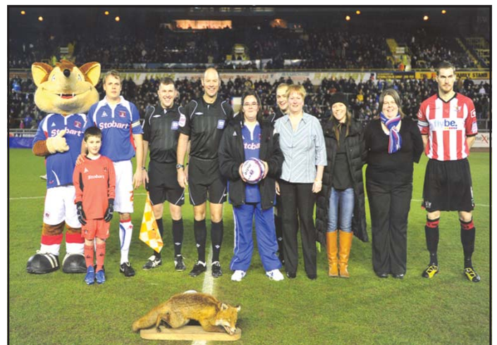
Carlisle United Supporters Away Travel matchball sponsors at the Carlisle v Exeter game last season